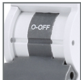
possibility of sealing