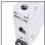
terminal capacity: max. 25 mm²