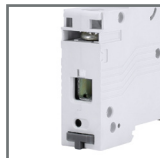
capability to connect using comb busbars